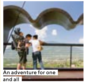
An adventure for one and all