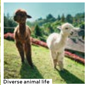
Diverse animal life