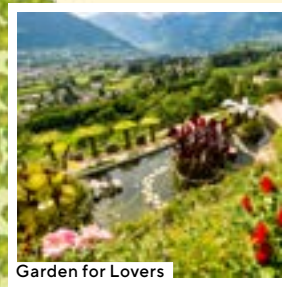
Garden for Lovers