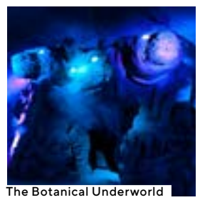
The Botanical Underworld