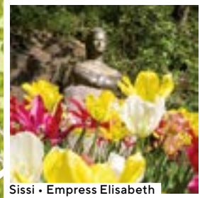
Sissi - Empress Elisabeth