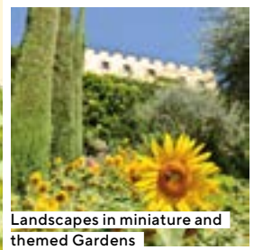
Landscapes in miniature and themed Gardens